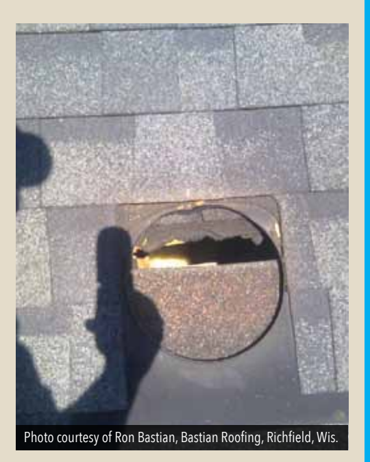
THE FIX: Cut the vent hole according to the manufacturer's installation requirements to maximize the vent's Net Free Area and to provide the attic with necessary airflow. RC