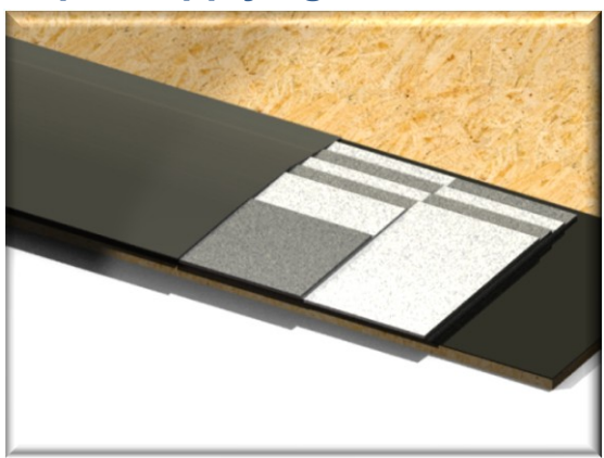
Step 4: Applying The Second Set Transition Shingles

The second set of shingles should mirror that of the first set, except only four layers thick to create a stepping down towards the roof deck. Continue with the shingle overlapping as specified by the shingle manufacturer, though the second set will not protrude from the roof deck as far as the first set will.