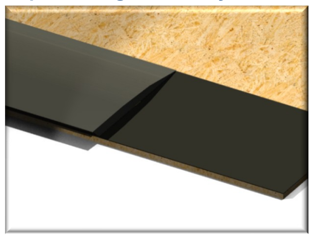
Step 1: Shingle Underlayment

Extend the same climate-appropriate underlayment used underneath The Edge Vent a minimum of 15" beyond the last section of vent to allow sufficient room for transitioning the vent to the roof deck. The deck slot should terminate before the end of the vent as shown in the instruction sheet.