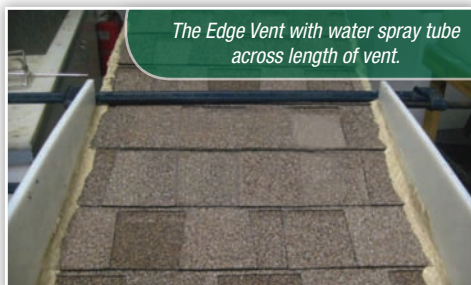
The Edge Vent with water spray tube across length of vent.

Take 1/3 of an ounce of water and distribute it over a 1-foot section of The Edge Vent. That's the amount of water that pools or ponds on the vent when it's slightly raining/drizzling. It's even less when it's a downpour. 1