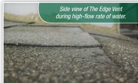
Side view of The Edge Vent during high-flow rate of water.

To simulate rainfall a water spray system was positioned two shingle courses above the transition point at The Edge Vent (the point where the vent's curve occurs). After testing both low-flow and high-flow rates of water, the amount of water ponding was 1/3 of an ounce or less.