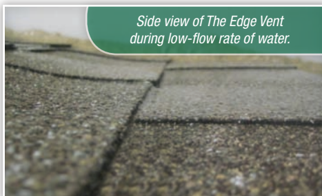
Side view of The Edge Vent during low-flow rate of water.