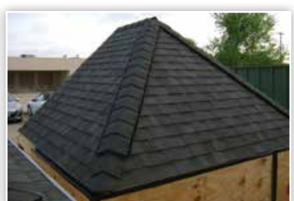
A wind generator with calibrated water spray system was used to subject Hip Ridge Vent to over 1,200 gallons of wind-driven rain at 35, 70, 90 and 110 MPH. The vent was tested on both a 3/12 and a 12/12 roof pitch. Hip Ridge Vent passed all the tests.

<sup>1</sup> Visit www.airvent.com to read the complete third-party test report. You can also view a short video on our web or YouTube in which the Hip Ridge Vent is undergoing the Miami-Dade County testing.