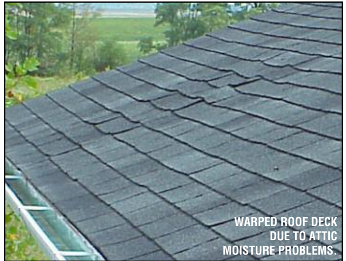
WARPED ROOF DECK DUE TO ATTIC MOISTURE PROBLEMS.

TURNING TECHNOLOGY INTO TOOLS FOR SUCCESS