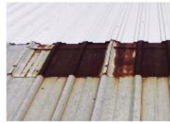
MBCI's Retro-R® panel system includes a foam baffle so heat will not be transferred from the old panel system to the new.

If you're looking to upgrade your roof to a standing seam, then installing our Double-Lok® roof panel is the way to go. If you're looking for the lowest cost solution, then the Retro-R® is the right choice for you.