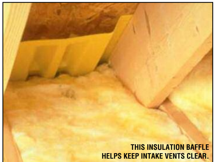
THIS INSULATION Baffle HELPS KEEP INTAKE VENTS CLEAR.

end of the house); roof louvers (round, square, and slant-back vents installed near the peak of the roof); wind turbines (higher-profile vents installed near the peak of the roof); power fans (electric or solar powered vents installed near the peak of the roof or in the gable-end of the house); and ridge vents (low-profile, shingle-over vents installed on the ridge or peak of the roof). No two types of exhaust vents should be on the same roof above a common attic because short-circuiting can occur. Mixing exhaust vent types can lead to weather infiltration through one of the vents, and leave portions of the attic incorrectly vented. This happens because air generally wants to follow the