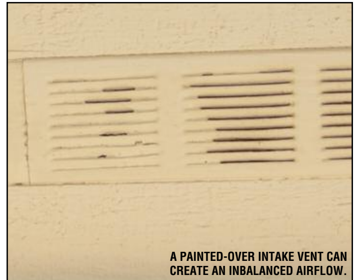
A PAINTED-OVER INTAKE VENT CAN CREATE AN INBALANCED AIRFLOW.

points to investigate during the exterior portion of the inspection.